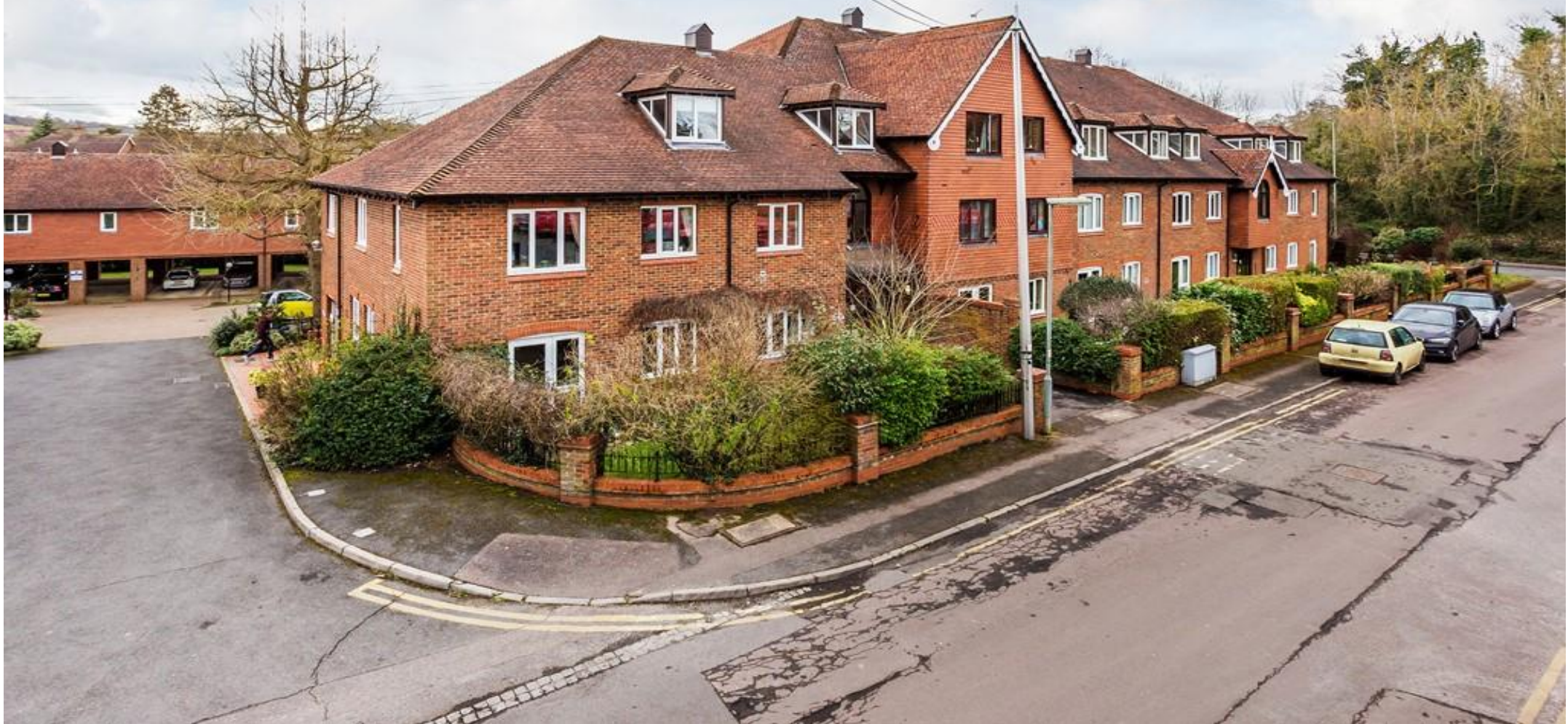
Holly Court , Belmont Road, Leatherhead, Surrey KT22 7DX